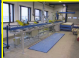
Stacking for Saw Lines